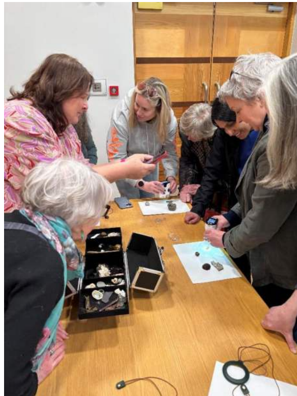
Members exploring sea materials and test their creativity

It was a memorable and inspiring end to the AGM, and we are very grateful to Tasneem for sharing her knowledge, insight and generosity with us.